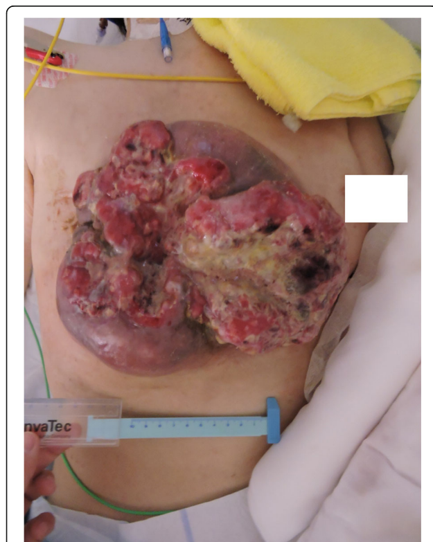
Fig. 2 Front view of the breast cancer skin ulcer on Day 4 of hospitalization. The tumor was approximately 20 × 20 cm in size with extensive necrosis. The image is anonymized to protect the patient's privacy

On Day 16, no sign of opisthotonus was observed, suggesting that the patient had entered a recovery period. Tracheotomy was performed on Day 19 to relieve the remaining grinding trismus. On Day 20, sound insulation and shading and sedation management were completed. Oral intake and rehabilitation commenced on Day 22. The patient was discharged from the ICU on Day 25. On Day 33, the tracheal cannula was removed, and the tracheostomy was closed.