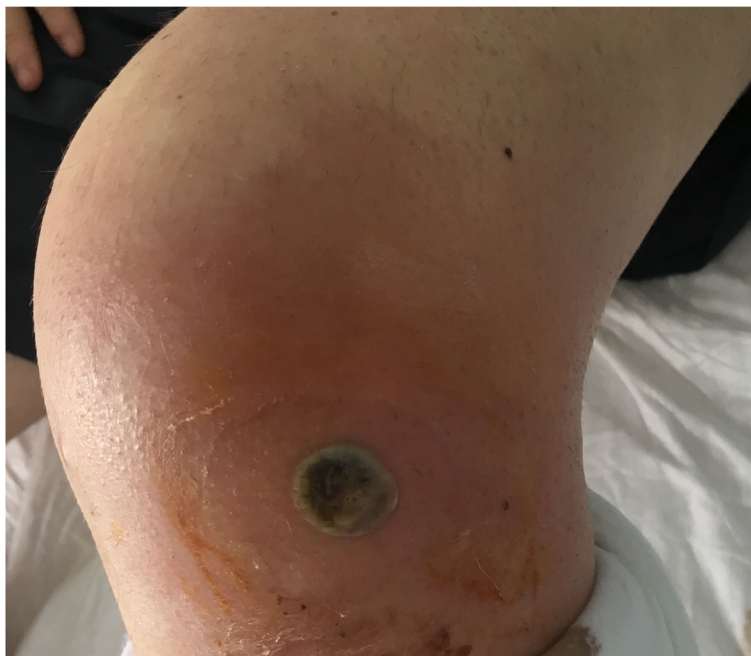
Fig. 1 Two months after the surgical procedure, the patient returned to control. In the post-operative period a fistula was observed on the site of the antero-lateral arthroscopic portal

Pharyngeal swabs obtained on 2 consecutive days yielded the same \alpha -hemolytic Streptococcus , which were isolated earlier from aerobic cultures. It should be remembered that \alpha -hemolytic streptococci may be members of the normal oropharyngeal flora [12]. Transthoracic echocardiography