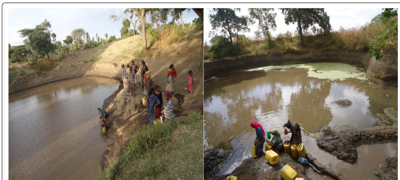
Fig. 1 Man-made reservoir grounds to store rain water in the study area

Thick and thin blood smears were made on the same slide, air dried and transported to the Adama Malaria Control Center. The slides were then stained with 10 % Giemsa for 15 minutes and screened for the presence of plasmodial infections. Two experienced microscopists read the slides blinded to individual's RDT results and to each other. Fortunately, the agreement of the two microscopists was 100 % in species identification. Parasite