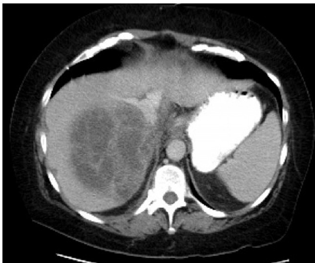
Figure 2 CT scan of the abdomen with contrast of Case 2 showing a large, loculated liver abscess measuring 10 cm.