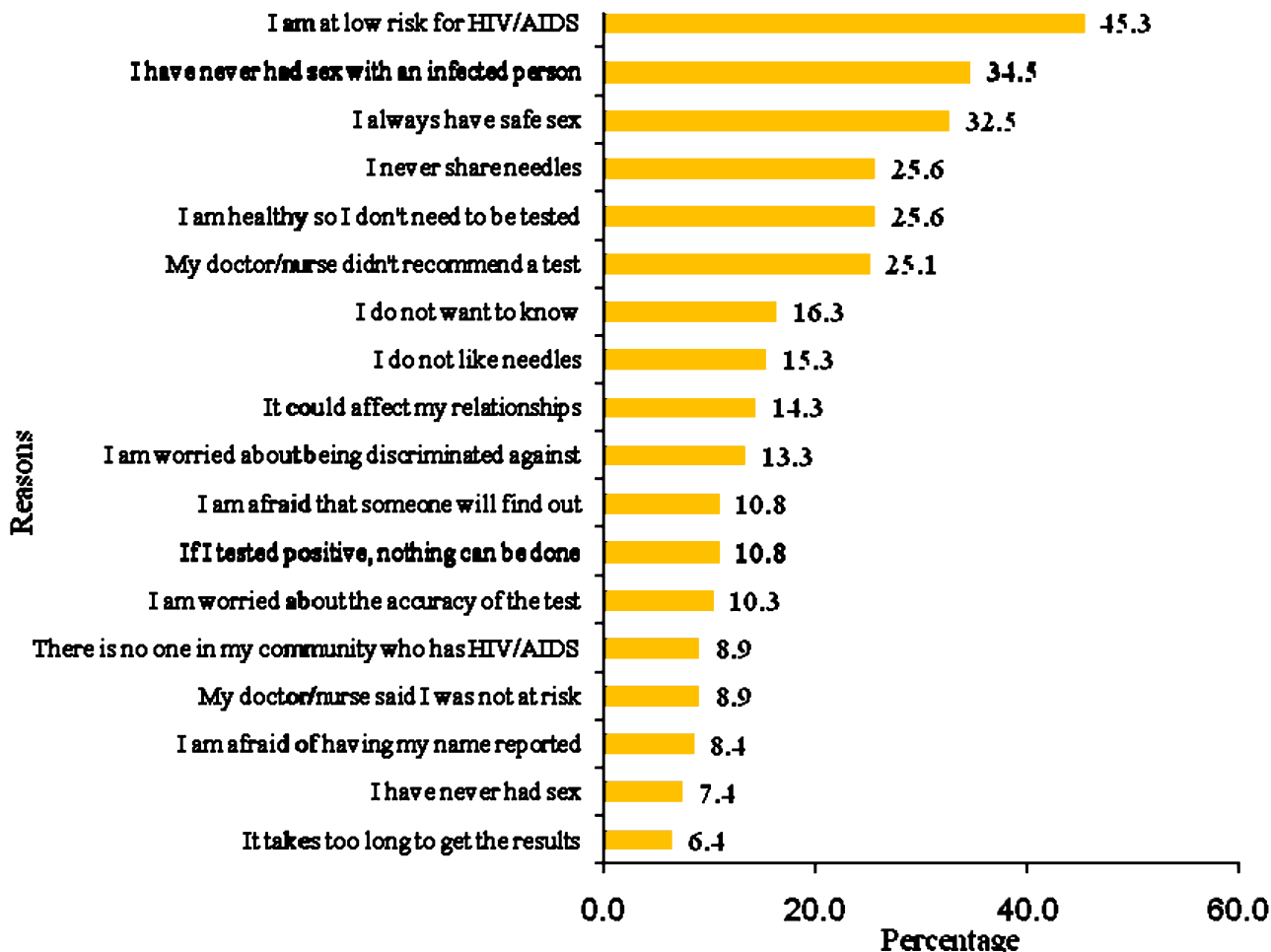
Figure 2 Reasons for not testing for HIV (n = 203).