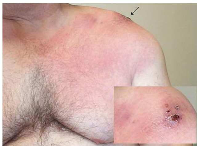
Figure 1 Left chest and shoulder, with arrow indicating site of prior injection into or near the acromioclavicular joint. Insert: Close-up view of area indicated by arrow.

The consulting rheumatologist concurred with the original diagnosis of seronegative rheumatoid arthritis. However, due to the presence of the unexplained rash, alternative and additional diagnoses were considered, including dermatomyositis, sarcoidosis, cutaneous leukemia or lymphoma, and infection. Erythrocyte sedimentation rate was >140 mm/hr, and C-reactive protein titer was 1:16. Anti-nuclear antibodies, uric acid, rheumatoid factor, C3, and C4 were normal. White blood cell count was 13,400 cells/mm 3 with a neutrophilic predominance, hemoglobin was 10.6 g/dL and platelet count was 400,000 cells/mm 3 . Serum albumin was 2.8 gm/dL. Serum electrolytes, renal function, liver tests, and creatine kinase were normal. A serum electrophoresis showed polyclonal hypergammaglobulinemia, and ferritin was elevated at 356 ng/ml, suggesting chronic inflammation. A chest radiograph was normal. A skin biopsy of the left