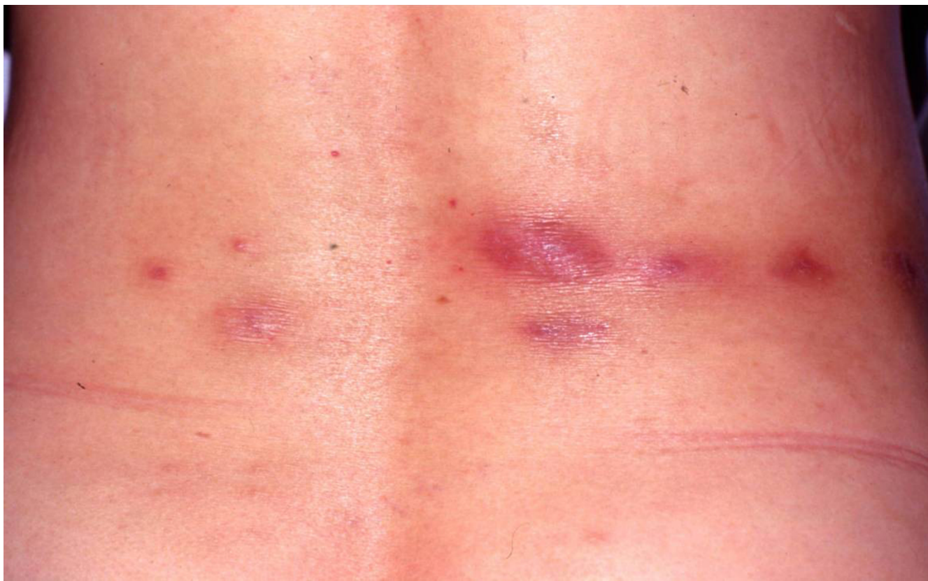
Figure 2 The back of a 58-year-old woman with typical disease presentation.

medium from 5 (63%) of the 8 samples. All of these isolates were submitted to the National Tuberculosis Institute, where they were identified as M. abscessus using standard biochemical methods and rpoB PRA. The remaining 35 patients were diagnosed based on clinical and histopathologic examination of the lesions. Biopsy specimens showed mixed suppurative and granulomatous inflammation with foreign bodies. Caseous necrosis was not observed.