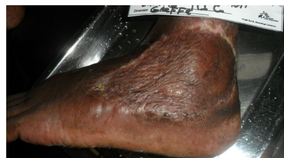
Figure 5 Healed BU lesion 10 months after commencement of antibiotics and 2 months post split skin graft.

It is not known whether paradoxical reactions are increased in HIV patients with BU, whether this is influenced by the baseline level of immune suppression or whether it is further potentiated when the generalised immune suppressed state is partially reversed by ART. However it is known that paradoxical reactions are common in HIV patients commencing ART with a variety of