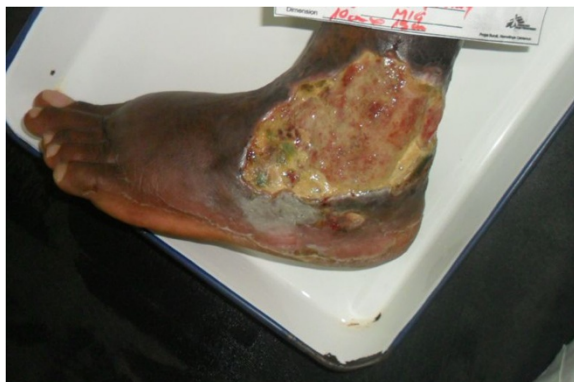
Figure 3 BU ulcer on lateral aspect of the left ankle showing significant reduction in swelling of skin and subcutaneous tissue of the forefoot with preservation of tissue following 10 days of prednisolone treatment.

We present a case of a severe paradoxical reaction occurring in an HIV-infected patient receiving combined BU antibiotic treatment and ART. The severity of the reaction threatened the viability of tissue around the BU lesion, especially across the dorsum of the left foot. The diagnosis of a paradoxical reaction was initially based on a consistent clinical picture where the lesion and surrounding tissue deteriorated after 3 weeks of antibiotics