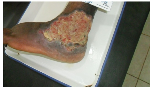
Figure 4 BU ulcer on lateral aspect left ankle showing significant reduction in swelling of skin and subcutaneous tissue of the forefoot with preservation of tissue following 30 days of prednisolone treatment.

[5,6]. This was later supported by the histological appearances that showed evidence of an intense inflammatory reaction consistent with previous descriptions of paradoxical reactions [6,9]. Paradoxical reactions, also known as immune reconstitution reactions, [9] are proposed to result from a reversal of the mycolactone toxin induced immune-inhibitory state via the antibiotic mediated killing of M. ulcerans organisms allowing an intense immunological reaction to develop against the persisting mycobacterial antigens [10,11]. As has been reported in HIV-negative patients following the completion of antibiotics, [12,13] a second paradoxical lesion developed on the retromalleolar region of the left ankle 6 months after antibiotics were ceased. Late reactions may account for up to 24% of paradoxical cases, [6] and this reaction was likely due to enhanced immune responses to a previously undetected disease focus.