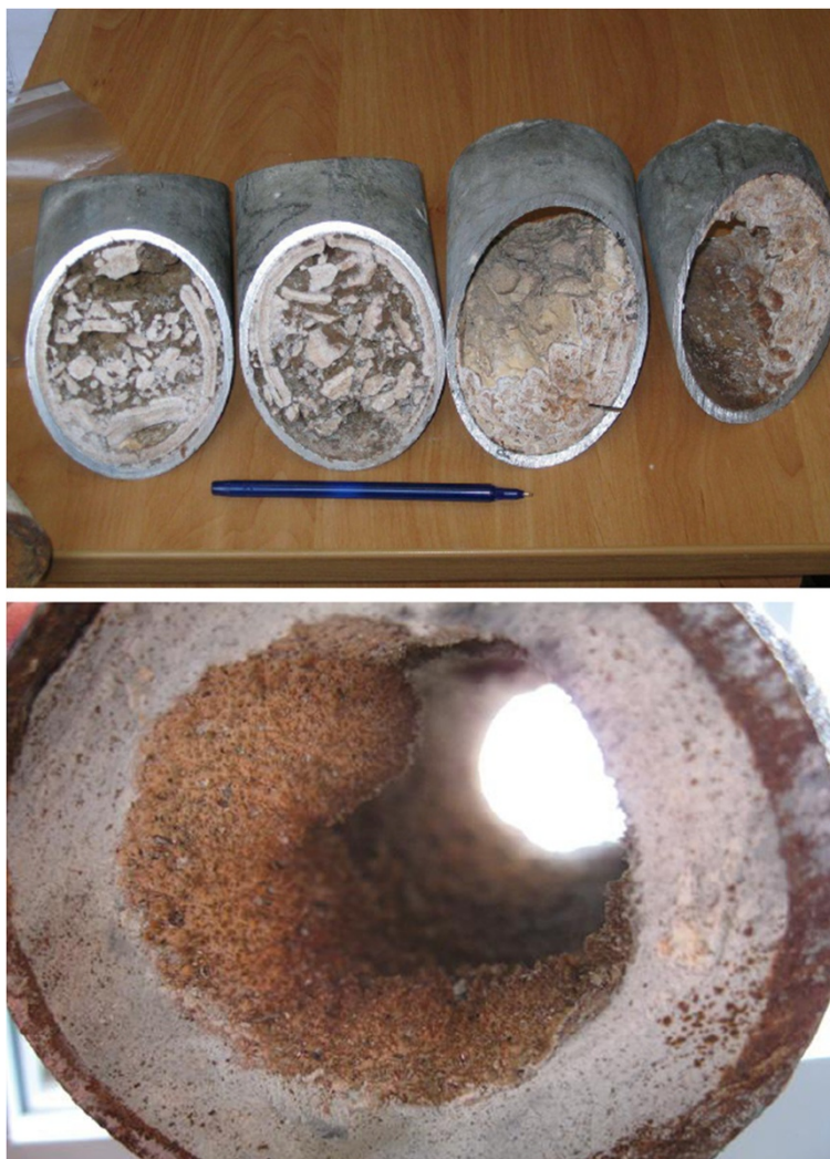
Figure 2 Inorganic deposits and biofilm in some of the water system tubes.