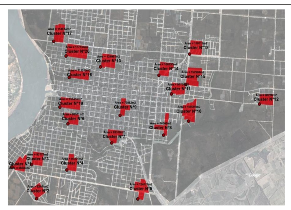
Figure 1 Grid sampling in Salto, Uruguay with cluster number, location and area.

corner of two crossing streets was taken and the U was constructed to include these spaces.