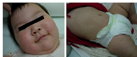
Figure 1 Typical skin rash observed in patients with CA9 infection. The most frequently observed pattern was generalized maculopapular without vesicular change. Face, trunk, and extremities are all commonly involved.

Sixty one percent of CA9-infected patients had skin rashes observed during physical examination (Table 1). The most common rash pattern was generalized maculopapular rash (size from 1 to 3 mm) extending to the face, trunk, and extremities as shown in Figure 1. Only 5% of CA9 rash patients had vesicular rashes (Table 2), which appeared as 1 to 3 mm vesicles dispersed on a maculopapular background. Hands and/or feet were involved in 10% of cases. In rare cases we also noted local or generalized morphology variants as morbilliform, scarlatiniform (sand paper-like), urticarial with pruritus, and nonblanchable petechiae. In 51% of rash cases, the exanthema was reported to appear after the first fever episode when the patient was still occasionally febrile. Three percent of rash cases did not experience fever.