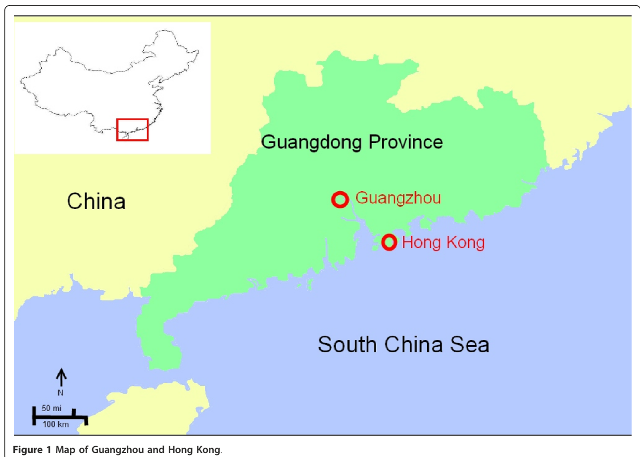
Figure 1 Map of Guangzhou and Hong Kong.

Mortality data for the period of 2004-2006 were obtained from the Hong Kong Census and Statistics Department and the Guangzhou Department of Health. According to Hong Kong Law all deaths from natural causes are required to be registered, so the mortality data in Hong Kong was fairly complete. The registered death data collected by the Guangzhou Department of Health covered the residents from the eight urban districts, but did not include the immigrant population and residents living in the two suburban districts. Therefore, the population denominator of Guangzhou did not change much during the study period. Given the fact that most immigrant workers are young adults and few