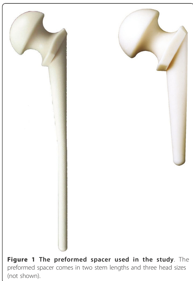
Figure 1 The preformed spacer used in the study. The preformed spacer comes in two stem lengths and three head sizes (not shown).

At least 5 different tissue samples were taken perioperatively in all the cases. Cultures were positive in 16 of 20 hips (80%). Staphylococcus aureus and coagulase-negative staphylococci (CoNS) (13/20) were predominantly identified (Table 1).