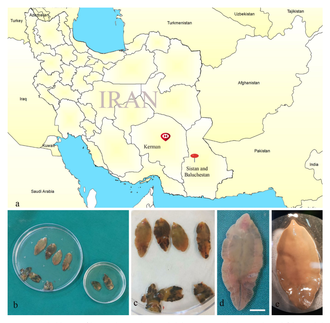
Fig. 1 (a) Geographical description of the patient's location in the Sistan and Baluchestan province, southeastern Iran (red pin) and Afzalipour Medical Center in Kerman (red H symbol). (b-e) Adult worms of Fasciola hepatica extracted from distal parts of the common bile duct of a 42-year-old female patient. scale bar: 5 mm

sequencing. DNA sequence polymorphism analysis using DnaSP V.6.12.03 software revealed four haplotypes and five polymorphic sites in the 423 bp fragment among the nine sequenced isolates.