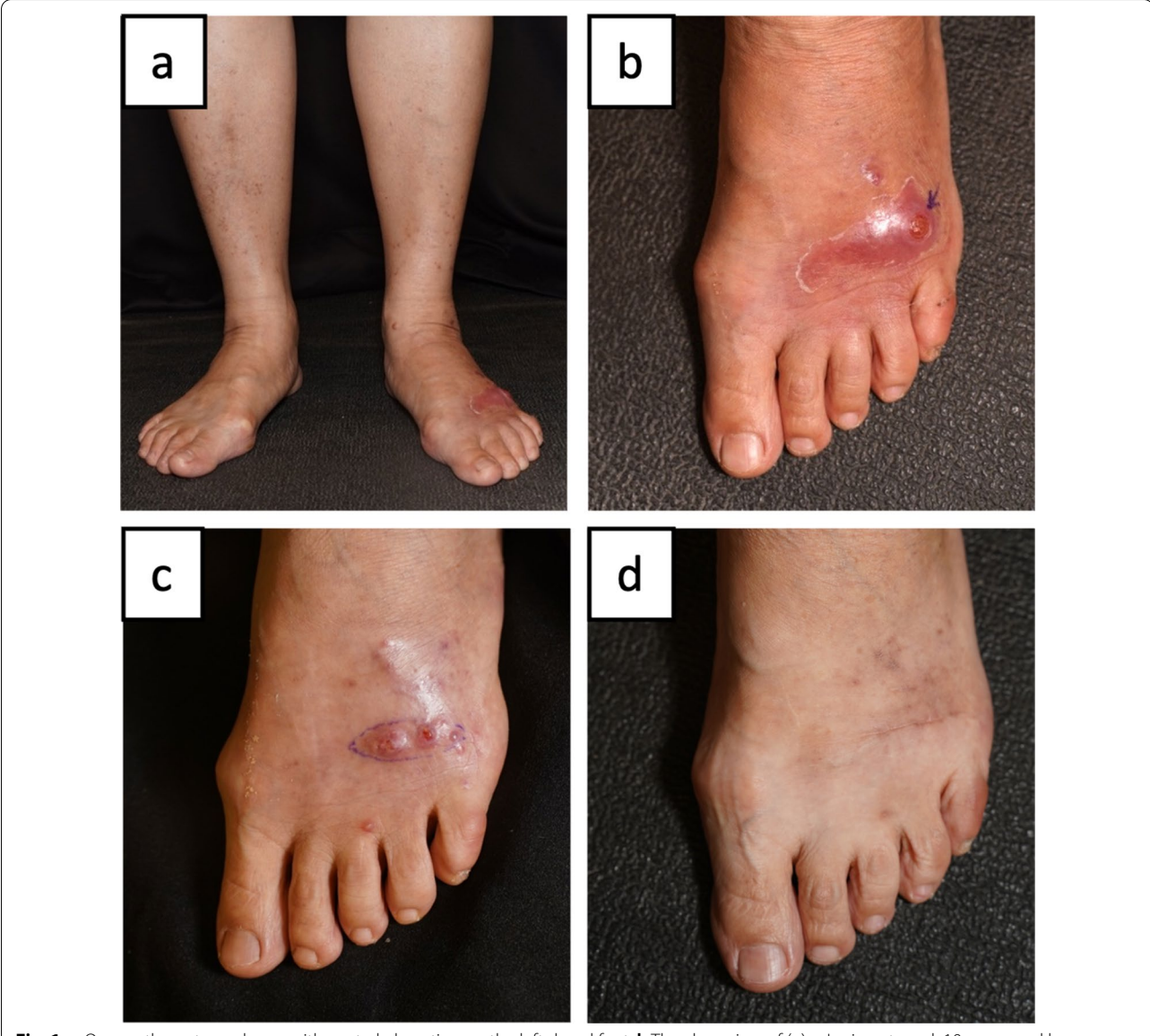
Fig. 1 a One erythematous plaque with central ulceration on the left dorsal foot. b The close view of (a). c Lesion at week 10 was cured by surgery. d No recurrence was found for 8 months

Library V2.0) to compare the extracted proteins from the colony to the reference, we successfully identified the pathogen to be the Mycobacterium farcinogenes– senegalense group (MS score 1.94; MS score 1.800–1.999 for species level for mycobacteria). After confirming the pathogen, the antibacterial regimens, featuring the combination of oral clarithromycin (1000 mg/day) and sulfamethoxazole/trimethoprim (Baktar<sup>®</sup>, 1960 mg/ day), were administered for 2 months. Nevertheless, sulfamethoxazole/trimethoprim was held 2 weeks later