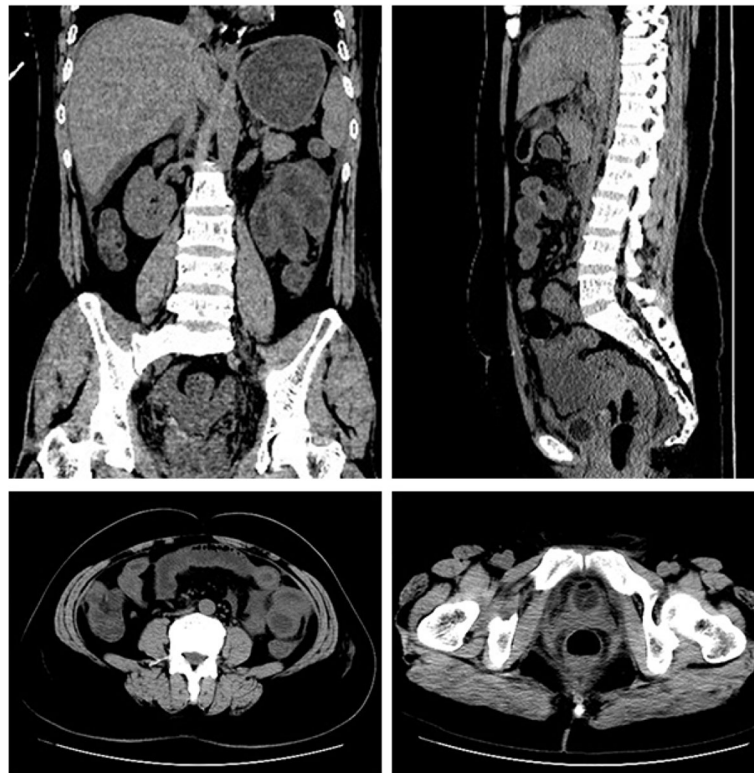
Fig. 2 CT plain scan of the pelvic and abdominal cavity

bilateral pleural effusions were observed on chest radiographs. It was necessary to intubate and ventilate the patient. As the PaO 2 /FiO 2 ratio increased to 377 mmHg and pulmonary edema and pleural effusions were improved on day 8 after surgery, ventilation could be stopped.