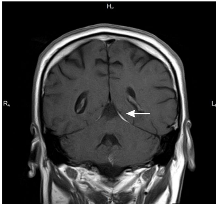
Fig. 2 Coronal T1-weighted scan after contrast enhancement - contrast enhancement is also visible in the cerebellar tentorium on the left