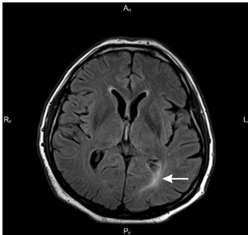
Fig. 3 Axial FLAIR scan