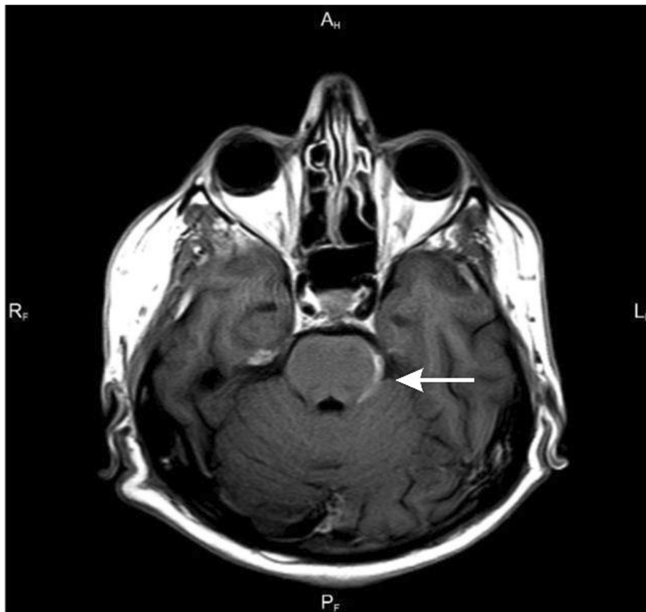
Fig. 1 Axial T1-weighted scan after contrast enhancement - contrast enhancement of the left lateral surface of the pons

ABI3500 automated sequencer (Applied Biosystems). The sequences were assembled with the BioEdit Sequence Alignment Editor version 7.0.1. For the comparative analyses of nucleotide and amino acid sequences, database searches were performed using the BLAST programs at the NCBI website ( http://www.ncbi.nlm.nih.gov ). This study allowed verification of the initial identification to Nocardia farcinica .