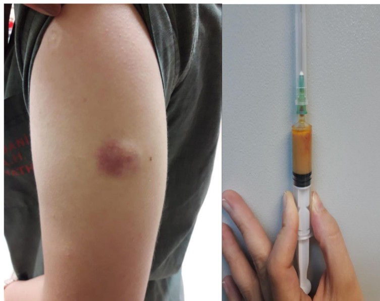
Fig. 1 Fluctuant and painless mass without warmth and erythema