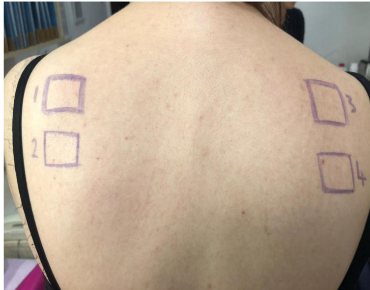
Fig. 3 Patch testing to the vaccine components