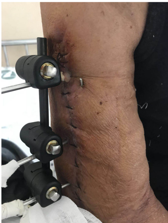
Fig. 4 Secretion was seen in the wound

Karlsruhe, Germany). The isolated strain was identified as M. houstonense by sequencing analysis. Monoclonal colonies were scraped and genomic DNA of the isolate was extracted using a commercial kit (DNeasy Blood and Tissue Kit; Qiagen, Germany). Primer design was based on the reports of Lane(1991) and CLSI MM18-A, and the primers for 16S rRNA PCR were as follows 27F: AGAGTTTGA TMTGGCTCAG, 1492R: TACGGYTACCTTGTTACGAC TT. The amplification conditions for PCR were based on those of previous reports [7, 8], and a PCR cycler (PTC220, Bio-Rad, USA) and first generation sequencer (Life Technology 2500 DX, ABI, Japan) were used. The amplified products were determined by comparing their restriction patterns with those available in the National Center for Biotechnology Information GenBank database. The results revealed sequence similarity (above 98.58%) with M. houstonense (GenBank accession no. NR_042913.1).