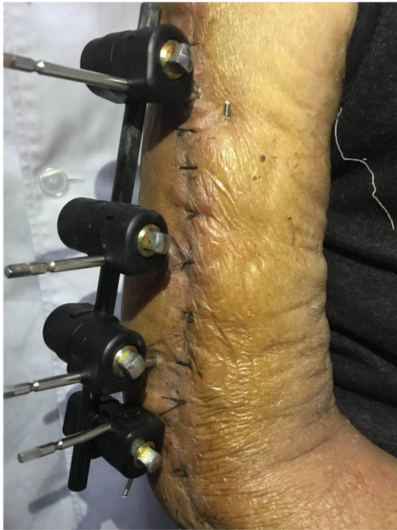
Fig. 3 External fixation of fracture were done