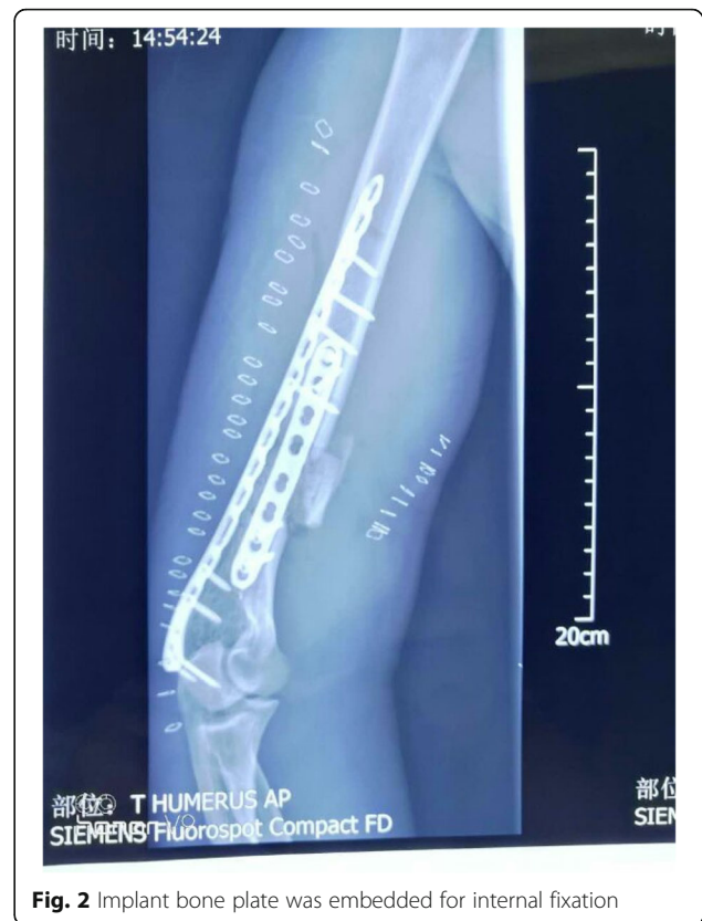
Fig. 2 Implant bone plate was embedded for internal fixation

procedure and interpretation of the results of the antimicrobial susceptibility tests were conducted in accordance with the CLSI 2018 guidelines [6]. Antimicrobial drugs and Mueller–Hinton media for the disk diffusion test were obtained from Oxoid Company, UK. The results showed that the strain was resistant to cefazolin, cefotaxime, cefepime, aztreonam, ampicillin, piperacillin, ciprofloxacin, levofloxacin, moxifloxacin, chloramphenicol, tetracycline and trimethoprim/sulfamethoxazole, but sensitive to gentamicin, amikacin, imipenem, meropenem, ceftazidime, amoxicillin/clavulanate, piperacillin/tazobactam, cefoperazone/sulbactam and ceftiofloxacin. Negative pressure attraction was performed with a progressive artificial skin cover and cefoperazone/sulbactam was used for treatment. Cefoperazone/sulbactam, which combined cefoperazone (2000 mg) with sulbactam (1000 mg), was used via intravenous infusion, once every 12 h.