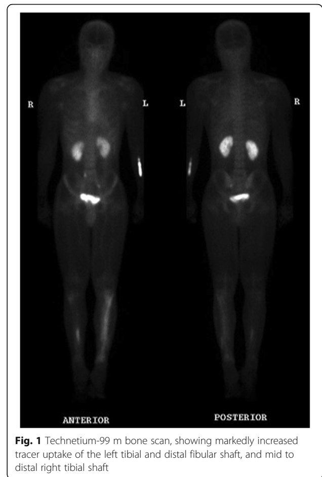
Fig. 1 Technetium-99 m bone scan, showing markedly increased tracer uptake of the left tibial and distal fibular shaft, and mid to distal right tibial shaft

Prior to presentation, a course of oral cephalexin was prescribed for presumed cellulitis, which made no difference to his systemic symptoms. On presentation, there was focal pain over the left and right anterior tibial surface. On examination, there was no clinical evidence of a subcutaneous collection. Further imaging of his lower limbs with a computerized axial tomography (CT) scan of both legs revealed bilateral tibial lesions with pronounced changes on the right, described as lattice-like linear lucencies involving the cortices with scalloping of the outer involved cortex. There was no soft tissue mass or periosteal reaction. These changes were further confirmed by a magnetic resonance imaging (MRI) and Technetium-99 m bone scan (Fig. 1). An initially elevated white cell count of 12.2 \times 10^9/L normalized after admission. He had a persistently raised C-reactive protein (CRP), which peaked at 130 mg/L, and an erythrocyte sedimentation rate (ESR) of 88 mm/h. Liver function testing, initially normal, became deranged with a cholestatic picture on day 12 of his