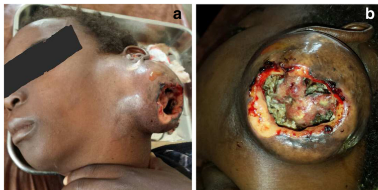
Fig. 1 a Giant disfiguring cervicofacial mass. b Ulcerated mass containing yellowish pus