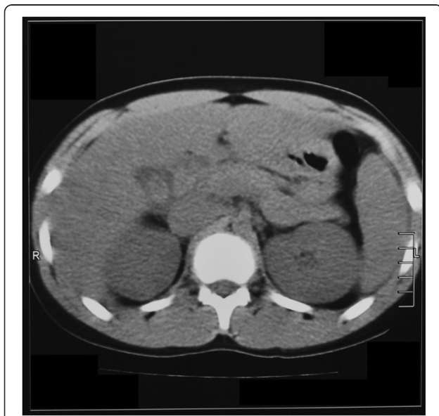
Figure 2 Non-contrast CT Abdomen of the patient demonstrating prominent edematous pancreas, pericholecystic fluid along with hepatomegaly.

Additionally in a clinical setup, when a patient presents with acute pancreatitis alone as in this case, leptospirosis might not be considered as an aetiology in the initial work-up because of the rarity. Later the patient may develop multi-organ failure due to leptospirosis, yet that might be attributed to the multi-organ involvement of acute pancreatitis. Ultimately, recognition of leptospirosis might get delayed compromising the optimum management.