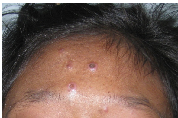
Figure 1 Cutaneous lesions initially presented as small papules, enlarged to larger papules with central necrotic umbilications. They were predominantly found on the face and extremities.

Upon admission to CMU Hospital, the physical examination revealed high-grade fever. Multiple painful ulcerated lesions were found on the lip and oral mucosa. Generalized non-pruritic erythematous papules and nodules with central umbilication were found over the face, body, and extremities (Figure 1). Marked swelling, warmth, and tenderness of many joints, including right shoulder, wrist, metacarpophalangeal, knee, and ankle joints were also noticed. Neither lymphadenopathy nor hepatosplenomegaly were found. Her laboratory results are shown in Table 1. CD4 + cell count was 11% or 51 cells/mm 3 . Plasma HIV-RNA level was < 50 copies/mL. Chest roentgenogram was normal. Roentgenograms of both wrists and ankles showed multiple round radiolucent defects of the bones (Figure 2). Skin biopsy showed necrotizing histiocytic granuloma formation with