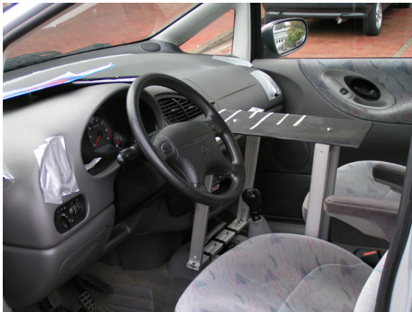
Figure 1 Preparation of study vehicles. Air outlets, that do not get sampled, are sealed by tape. An adjustable board is placed between the front seats.