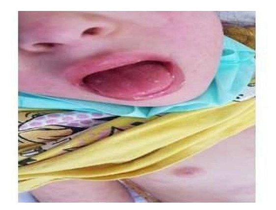
Fig. 2 Patient with Strawberry Tongue

The data analysis in this study was conducted using MS Excel. Continuous variables were represented as count, median, interquartile range (IQR), mean, and standard deviation. Categorical variables were represented as counts and percentages.