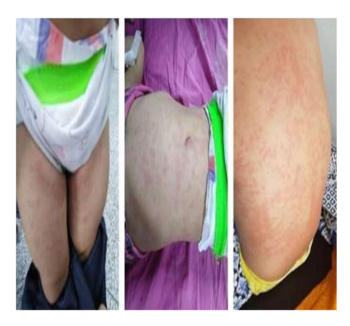
Fig. 1 Patients with rash in trunk and extremities

abnormalities, and pericardial effusion. All patients received treatment with intravenous immunoglobulin (IVIG) (2 g/kg) and aspirin (30–50 mg/kg). Patients with relapsed fever were treated with methylprednisolone (MDP) (2 mg/kg). Those with coronary dilation and aneurysm received antiplatelet therapy. No patients required vasopressor support. The outcome in our study represented as recovery, death, and any complications presented during the hospital stay.