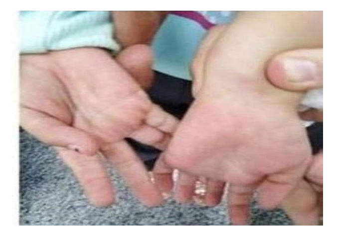
Fig. 3 Patient with hands edema

Regarding treatment, all patients received IVIG (2 g/ kg) and aspirin (30–50 mg/kg), with approximately (86%)