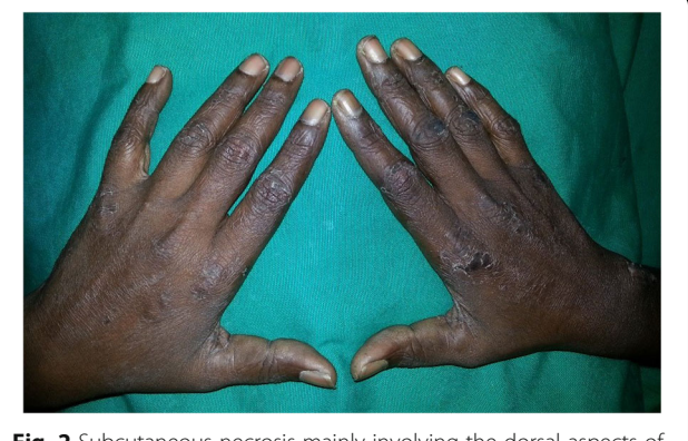
Fig. 2 Subcutaneous necrosis mainly involving the dorsal aspects of the joints of hands

Transesophageal and transthoracic echocardiograms did not show evidence of infective endocarditis or myocarditis. ASOT titre was <200 Units. Chest radiograph was normal, and ultrasound scan of the abdomen revealed mild hepatomegaly. Intravenous vancomycin, oral doxycycline and azithromycin were added on the 3rd day of admission to cover severe gram positive sepsis and rickettsial infections. The IFA-IgG titre against Rickettsia conorii Ag was positive at a titre of 1: 8192 and leptospira antibodies were negative by both Microscopic Agglutination Test and ImmuneMed Leptospira Rapid Immuno-Chromatographic assay for qualitative detection of IgM, IgG antibodies to Leptospira. The patient showed gradual improvement with reduction in fever by the 2<sup>nd</sup>day of doxycycline (5th day of admission) and had a complete recovery from acute kidney and liver injury by the 4th treatment day. However, her skin rash and the joints became very painful over the 2nd-4th days of treatment. All these resolved completely within 5 days of treatment (8th day of admission), and she was discharged on the 11<sup>th</sup>day of admission. On review after one week of discharge, her rash had started to desiccate