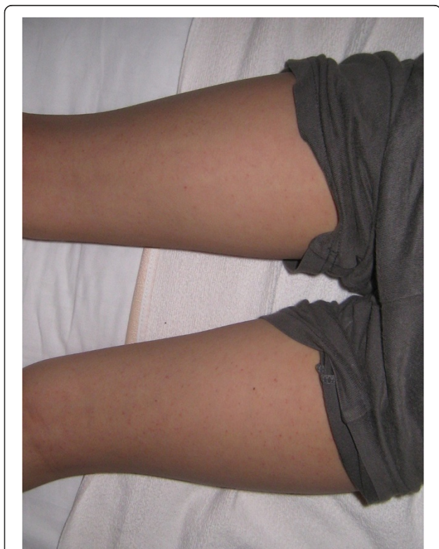
Figure 1 Petechial rashes observed on patient's legs at admission.

On admission, his temperature was 38.8°C, but he was in a stable condition. A 5×5-cm 2 mass was located on the right temporal region of his scalp. The mass was soft and non-tender without signs of inflammation. Petechial rashes were also observed on his oral cavity, trunk, and limbs (Figure 1). At the time of blood sampling, new petechiae easily developed at the tourniquet-compressed site. Table 1 shows the results of laboratory tests. On admission, platelet count and coagulation tests were normal, and mildly impaired white blood cell count and elevated C-reactive protein suggested the presence of a viral infection as the cause of fever. Computed tomography of the head showed subcutaneous hemorrhage without evidence of skull fracture or intracranial