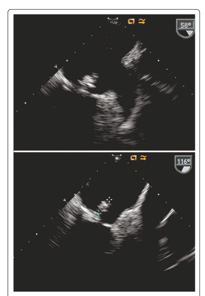
Figure 1 A 13-mm echogenic mobile mass can be seen posterior to the mitral valve leaflet at 58° and 116° on the transoesophageal echocardiogram. In addition, mitral stenosis (valve area = 1.7 cm²) with a thickened and partially mobile posterior mitral valve can be seen on the transthoracic echocardiogram.

infarction in both the cerebral hemispheres and the cerebellum (Figure 2). On day 2 of hospitalization, fever above 38°C was noted; therefore, blood culture test was performed. She was administered ceftriaxone (2 g/d) and gentamicin (3 mg·kg<sup>-1</sup>·day<sup>-1</sup>) as an empirical treatment for infective endocarditis.